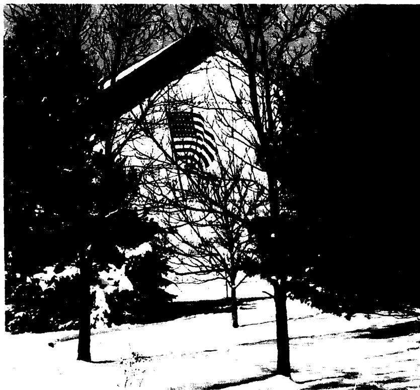
The Doran-Shockey barn with Civil War-era American flag

www.newalbanyplaintownshiphistoricalsociety.org