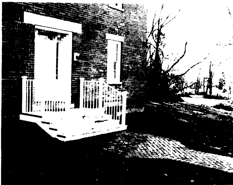
Front of the Ealy House, with the newly constructed brick walk. The bricks have been laid in the same pattern as those of the original brick walk.

The New Albany-Plain Township Historical Society P.O. Box 219 New Albany, OH 43054